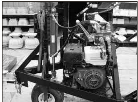
Hydraulic front wheel and 11 hp Engine.